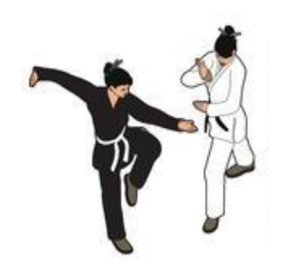
THE ASIAN MARTIAL ARTS